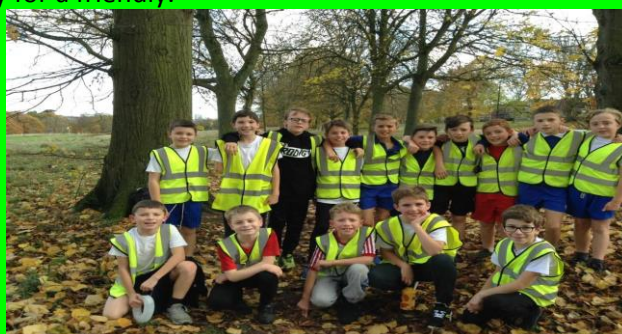
BOYS CROSS COUNTRY SQUAD