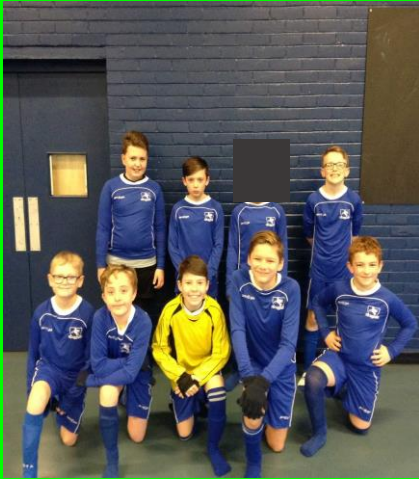
YEAR 5/6 BOYS FOOTBALL TEAM